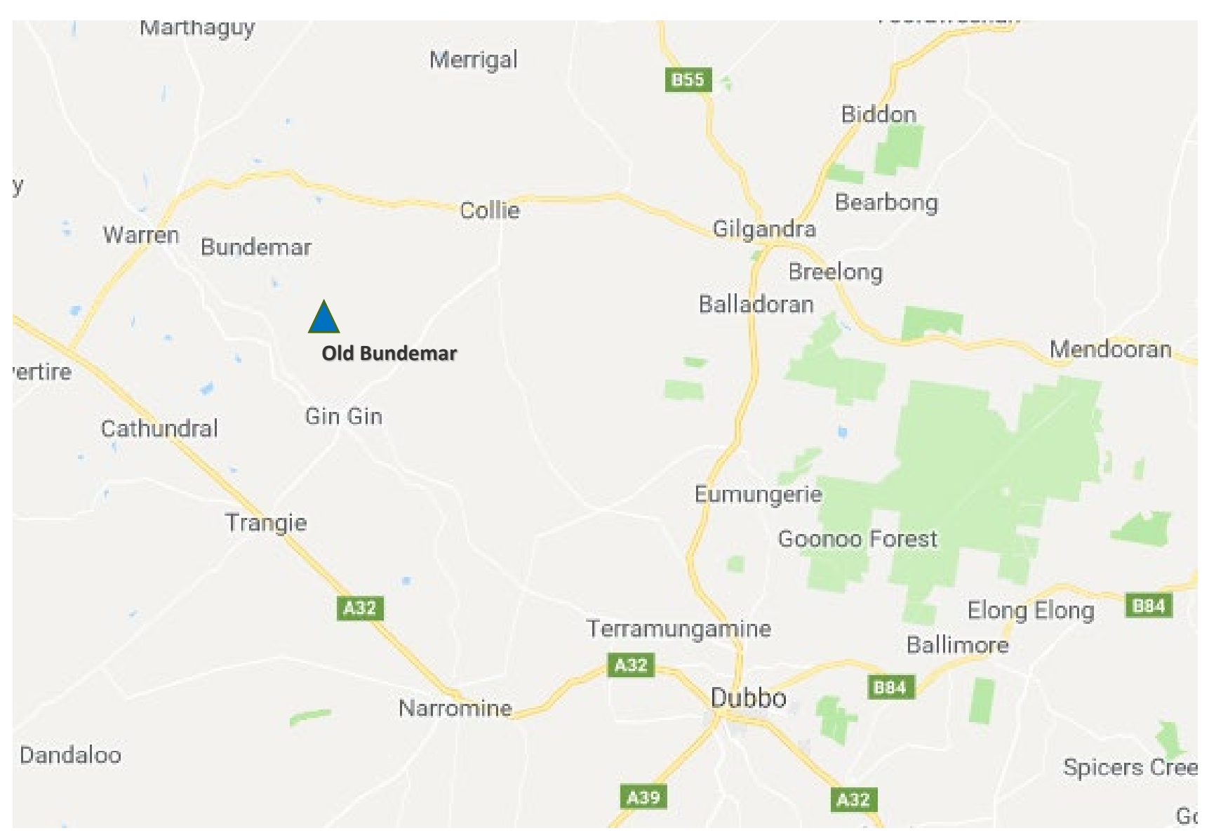
Figure 1 Site Location