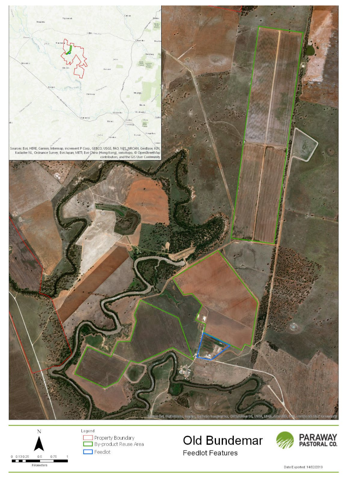
Figure 2 Site Features